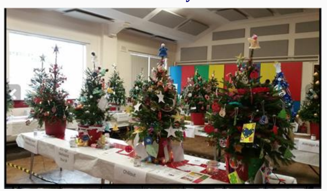
If, so please book your slot with Vikki by Sunday 17th November 2024.